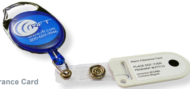
Alarm Clearance Card with retractable holder