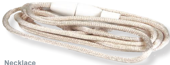
Necklace adjustable nylon cord with breakaway feature