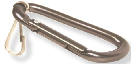
Belt Loop Attachment Carabiner with J-hook