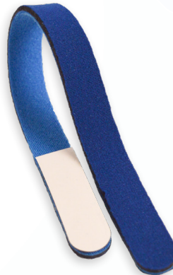
Velcro Strap & Strip