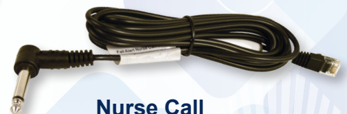
Nurse Call Connection Cord