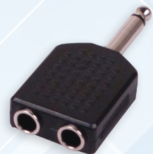
Nurse Call Y Adapter