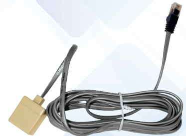
10' Extension Cord