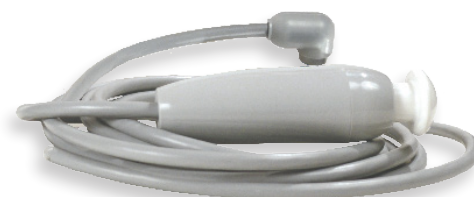
Locking Call Cord