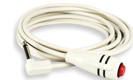
Standard Momentary Call Cord