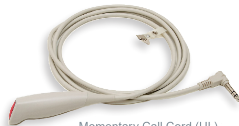
Momentary Call Cord (UL)