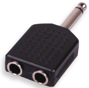
Y-Adapter for dual occupancy