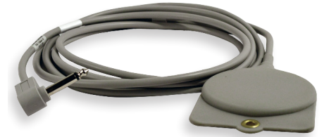
Pad Call Cord