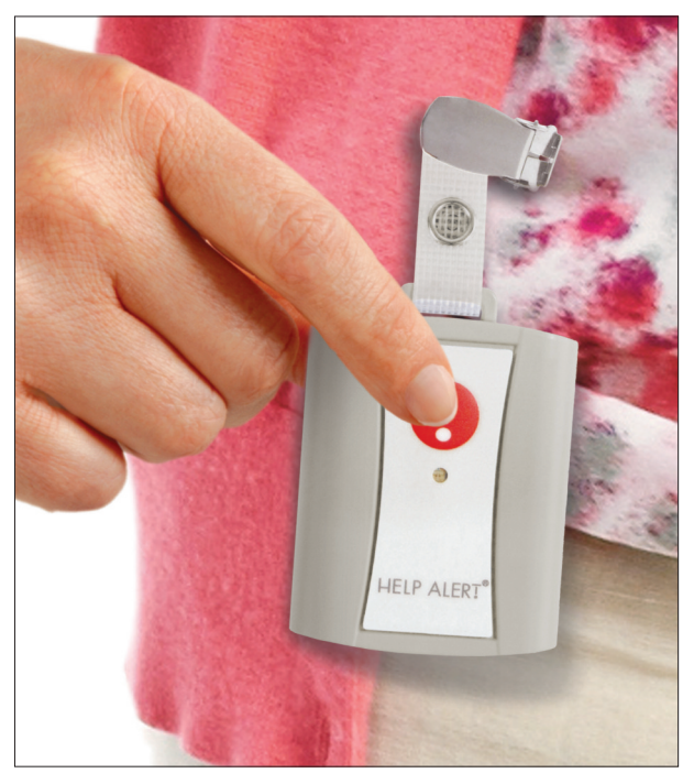
All personnel are equipped with RFID pendants that they can either clip to a belt or some other article of clothing, or keep in a pocket.

Falcon and Dom Demangone, a supervisor at Westmoreland Intermediate Unit 7, which oversees Crossroads, believed a better security system would ease concerns of teachers, students and parents, as well