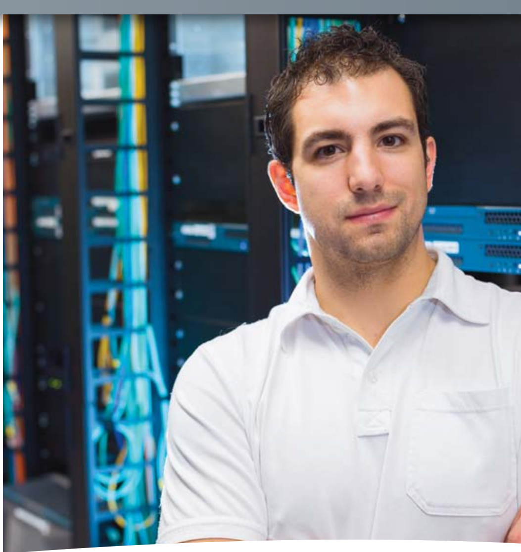
Service & Support