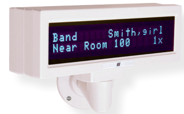
Quick Look™ Display